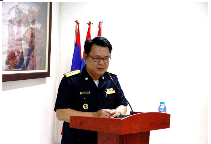
Image: The contract signing ceremony between Tax Department, Ministry of Finance and Banque Pour Lec Commerce Exterior Lao Public